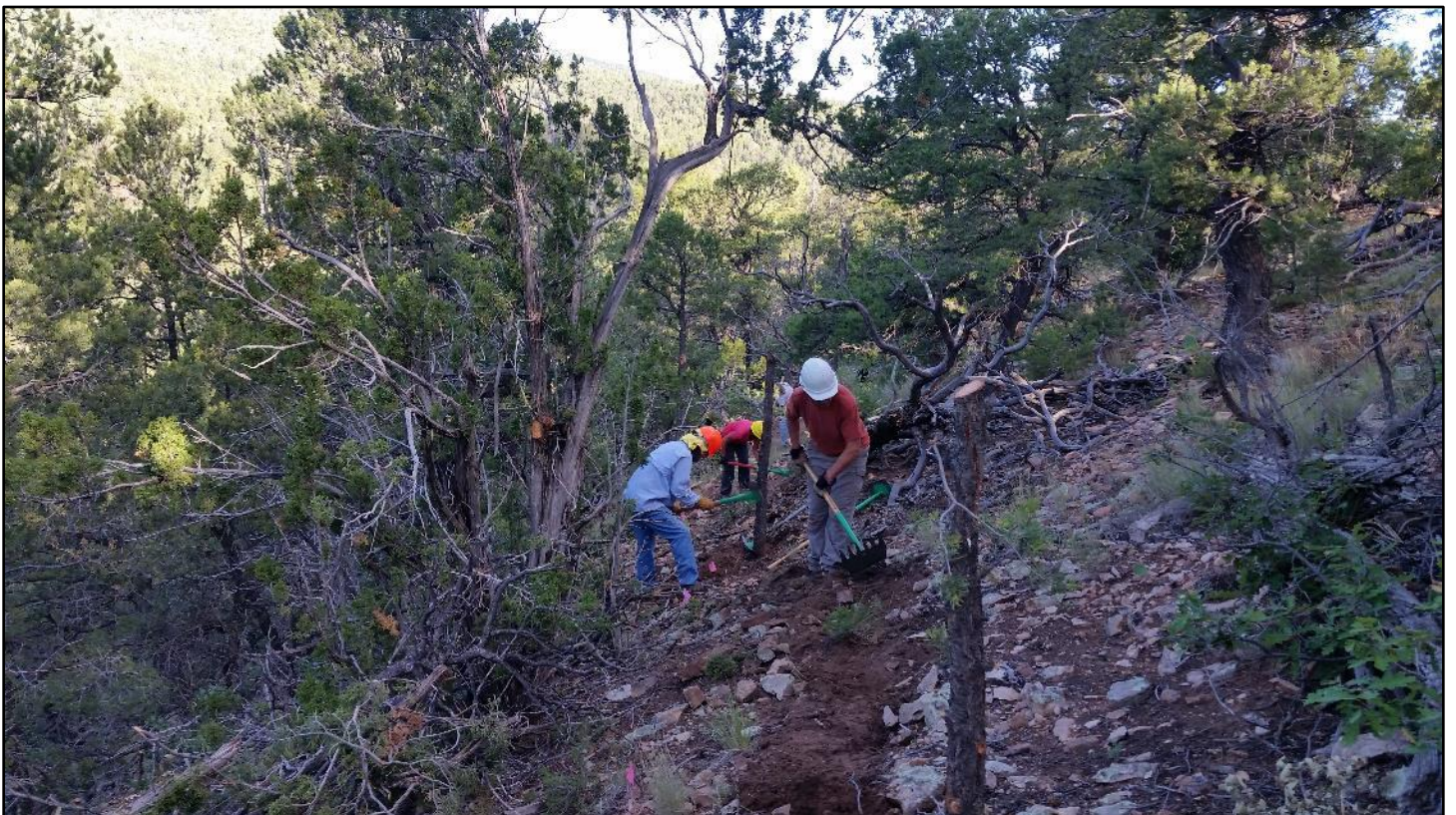
Scraping loose rock out of the trail corridor while the FOSM Stumpmeister gets to work.