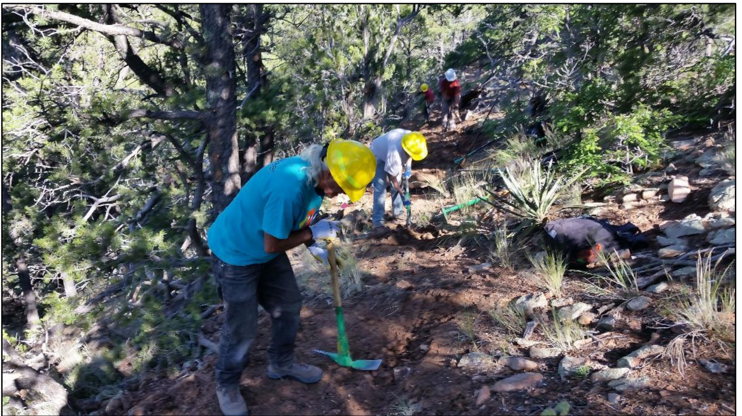
Remember, these guys aren't being paid to work this hard!