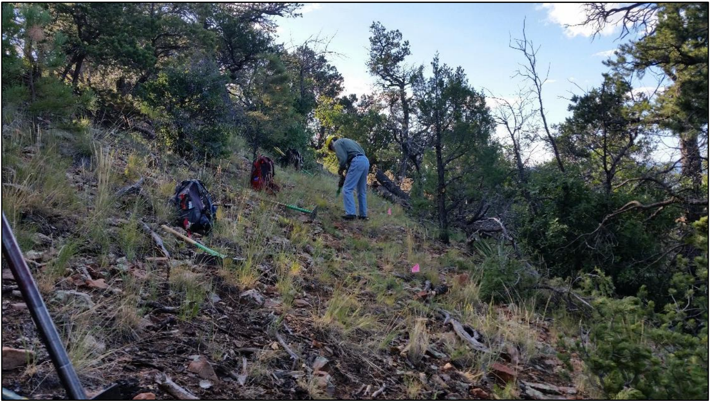
Before: first tool swing into a new trail section.