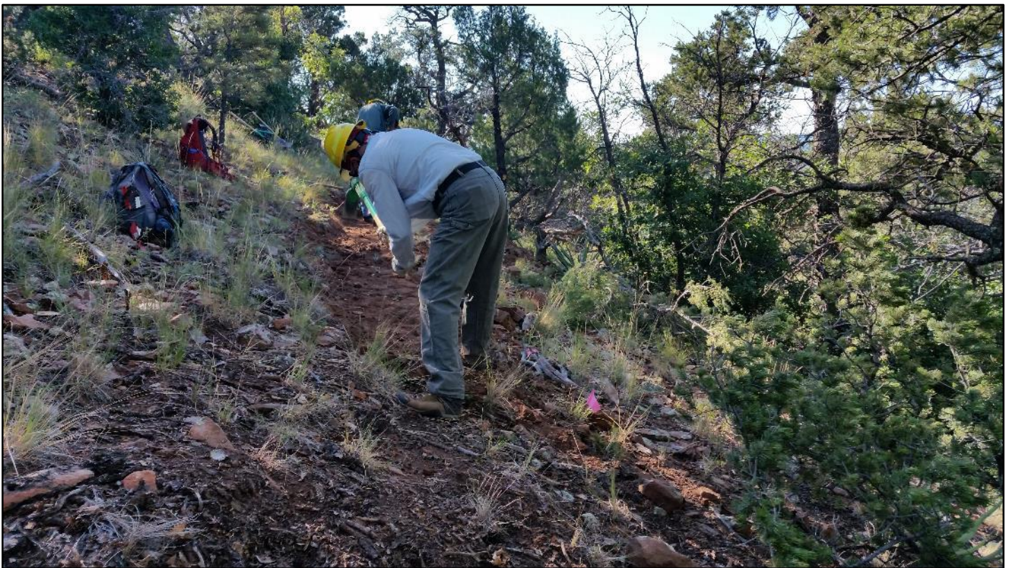
During: hmmm, all of a sudden there is a lot of hard clay under these rocks...