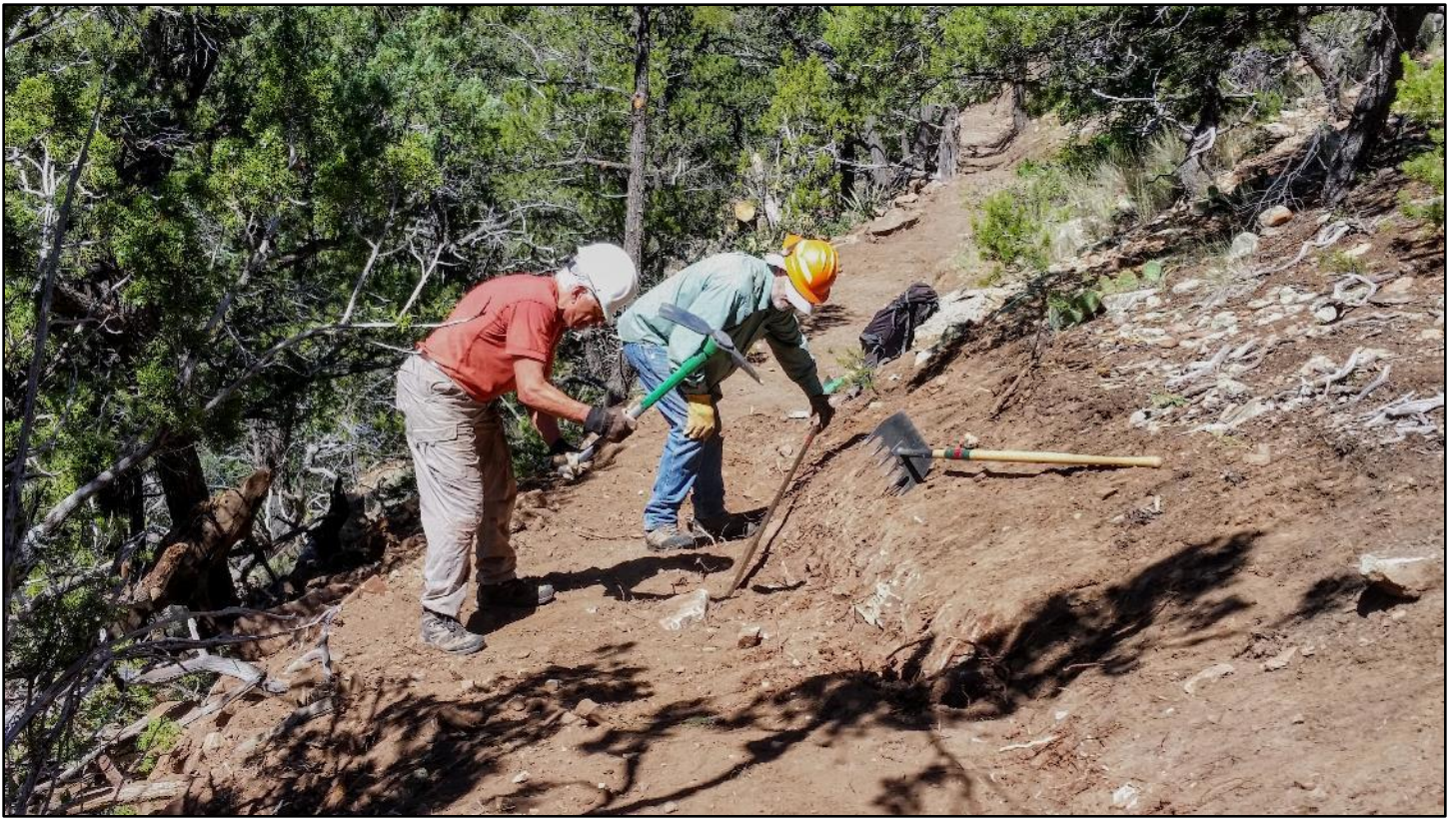
This rock near the backslope just had to come out. A lot of work went into this section.