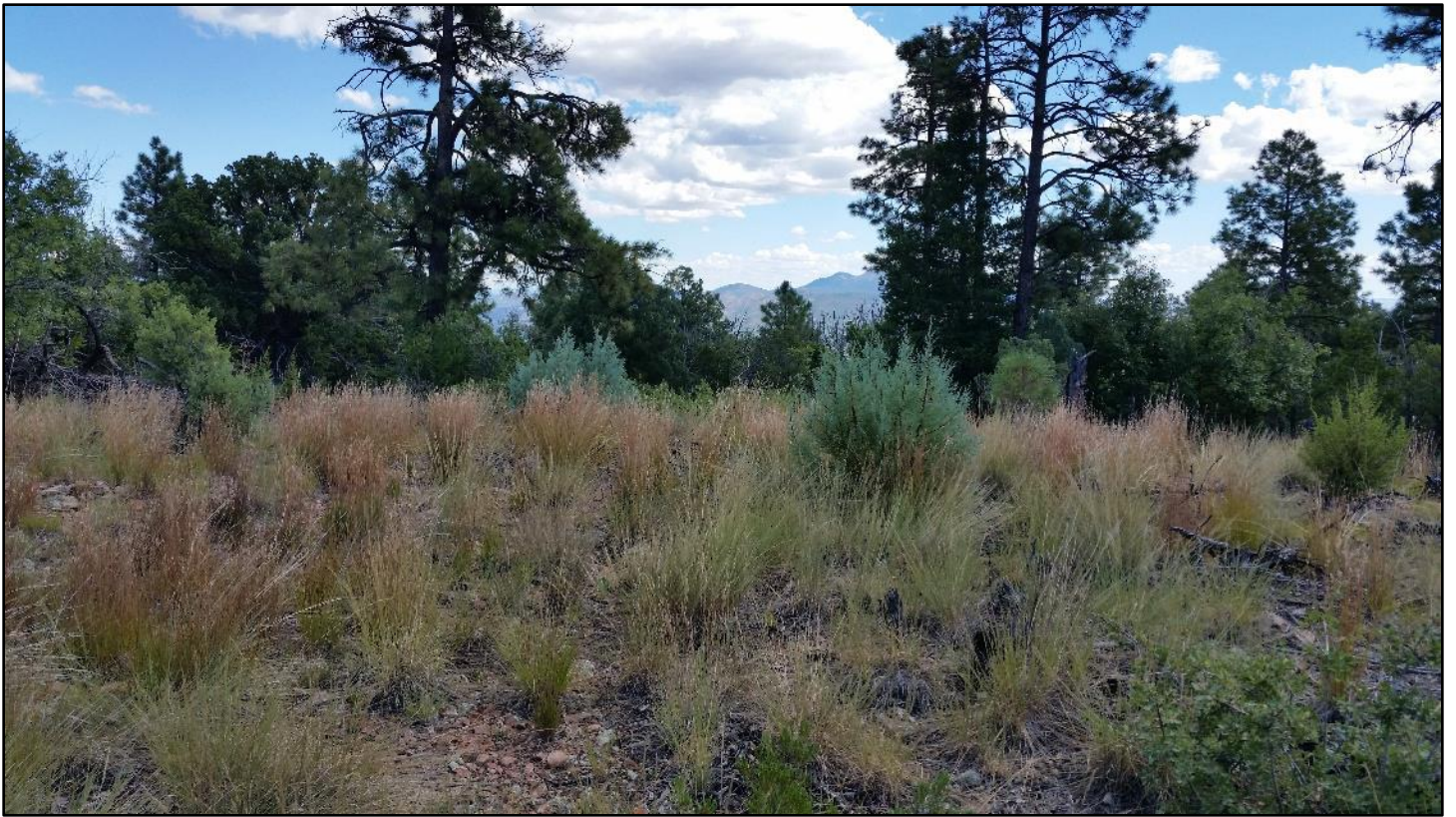
The crew is looking forward to getting up to the top of the ridge. Maybe by next session.