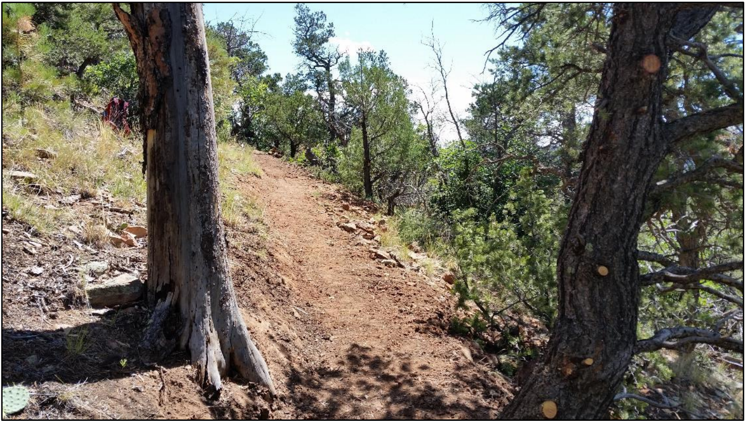
After: through the tree portal, the finished trail appears.