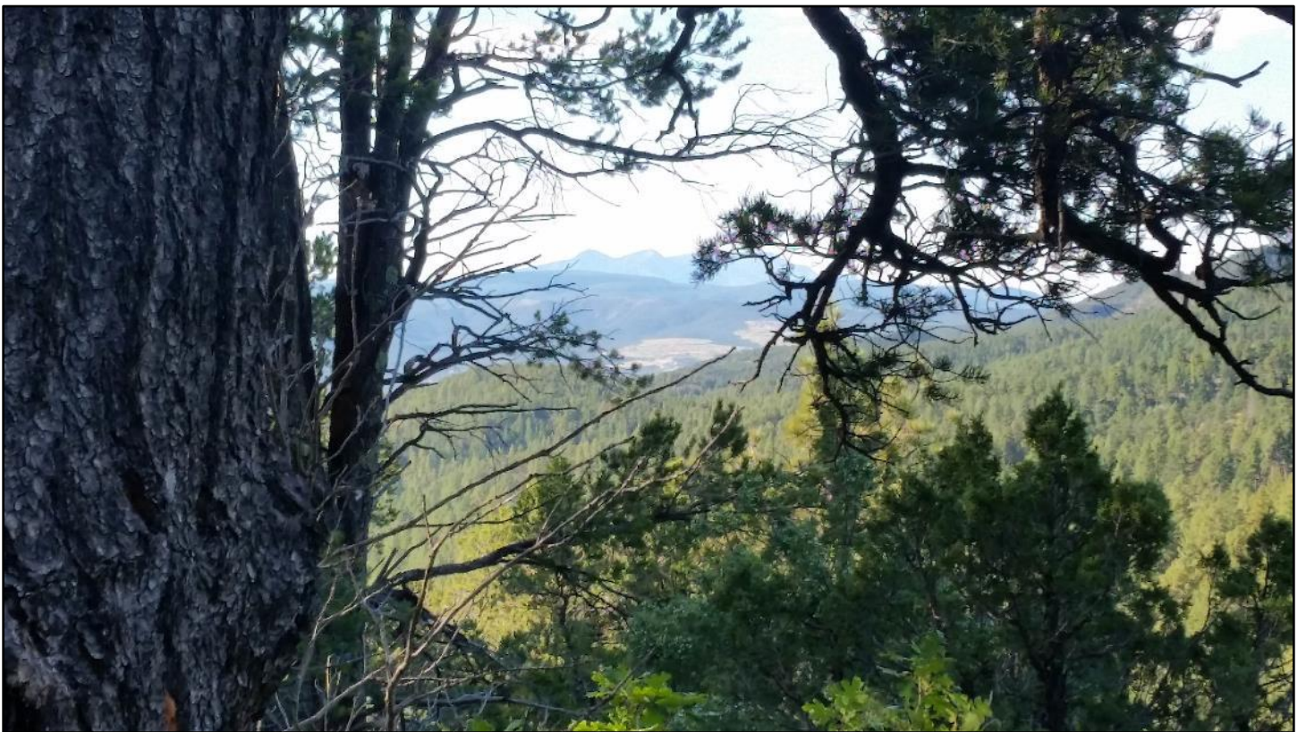
Looking the other direction on Vista Trail, one can see all the way down to the cement plant.