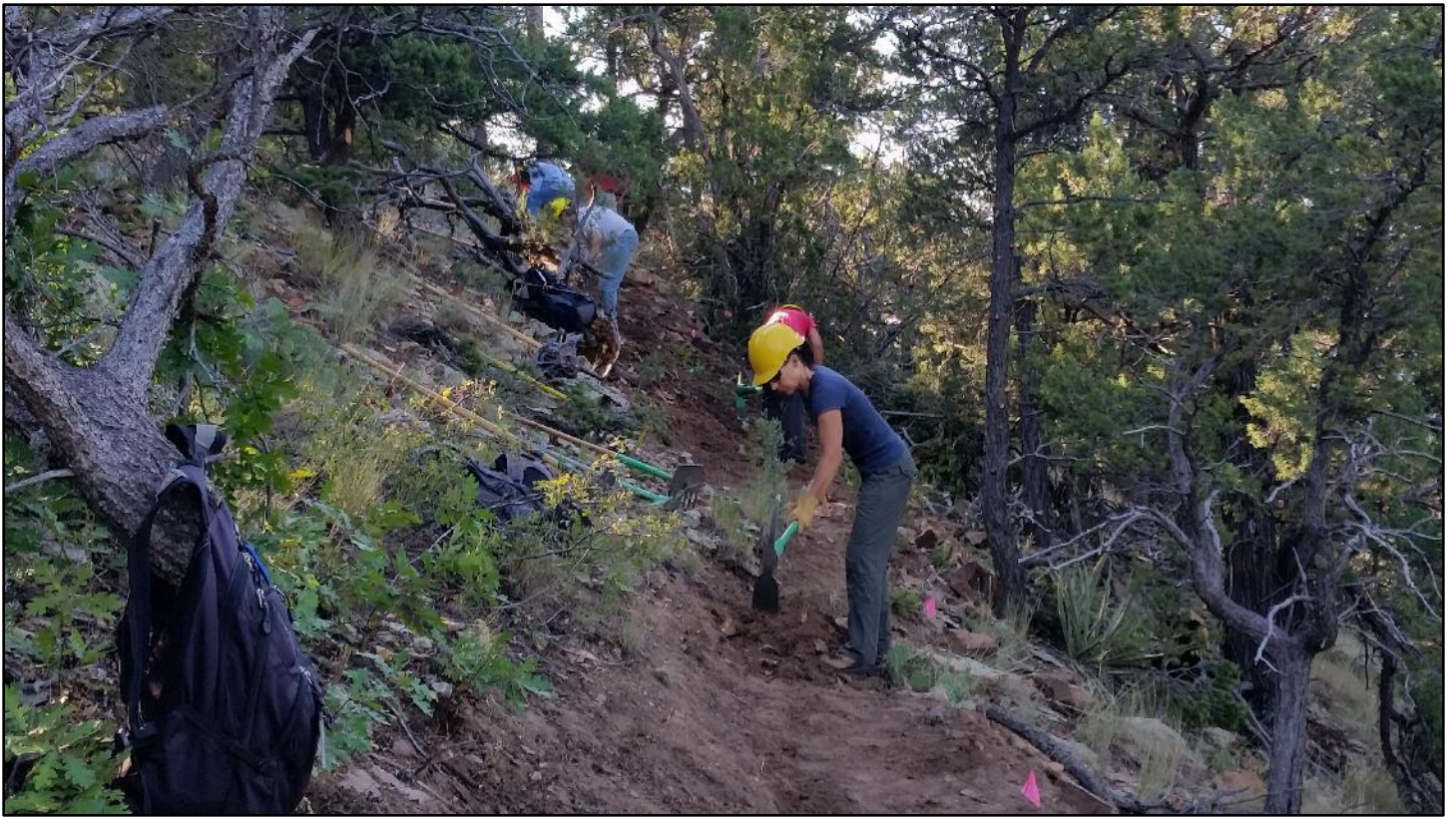
The process here was rough out the tread, level it, rework it, level it, rework it, repeat...