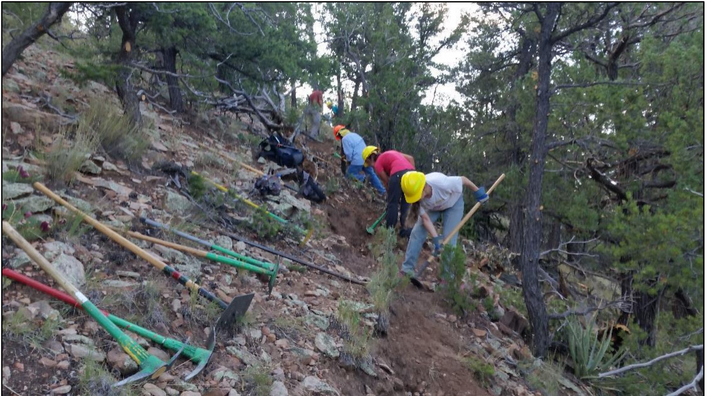
Plenty of tools to go around as the crew works their way up steep terrain on Vista Trail to the ridge.