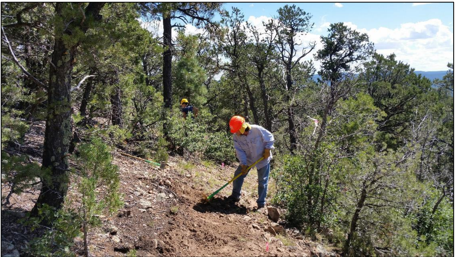
It was almost chilly in Tijeras when we met, but working in the sun later got pretty warm.