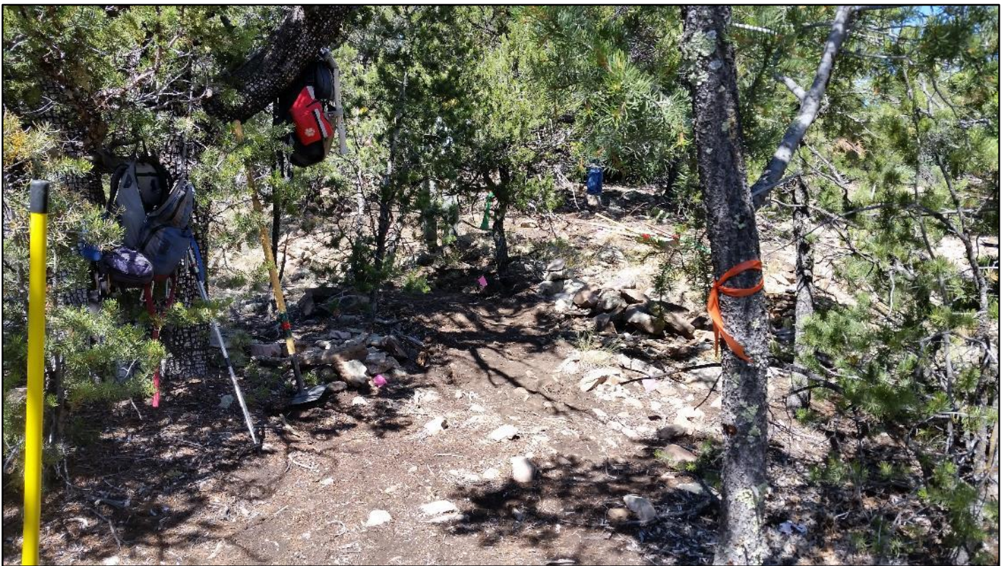
The tread here is actually finished except for the scraggly pinon saplings left in the middle of the trail.