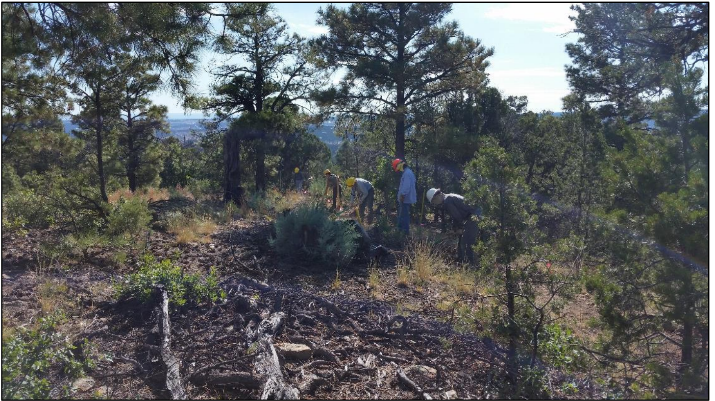
Finally! The crew is up on top of the ridge. But there is much less shade here.