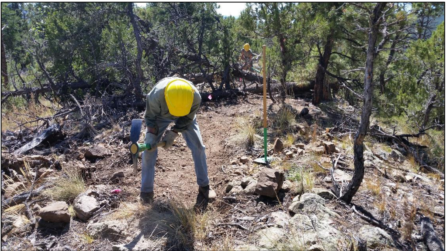
In spite of the rocks, this guy is carving out great tread. Hmmm, chainsaw needed up ahead.