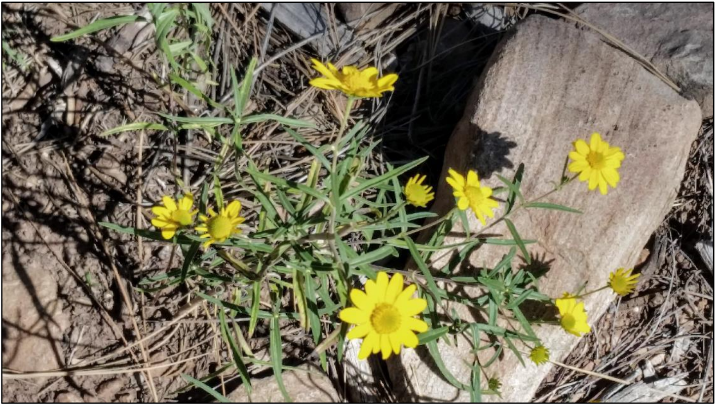
The wildflowers are tailing off for the year but it is show time for the showy goldeneye.