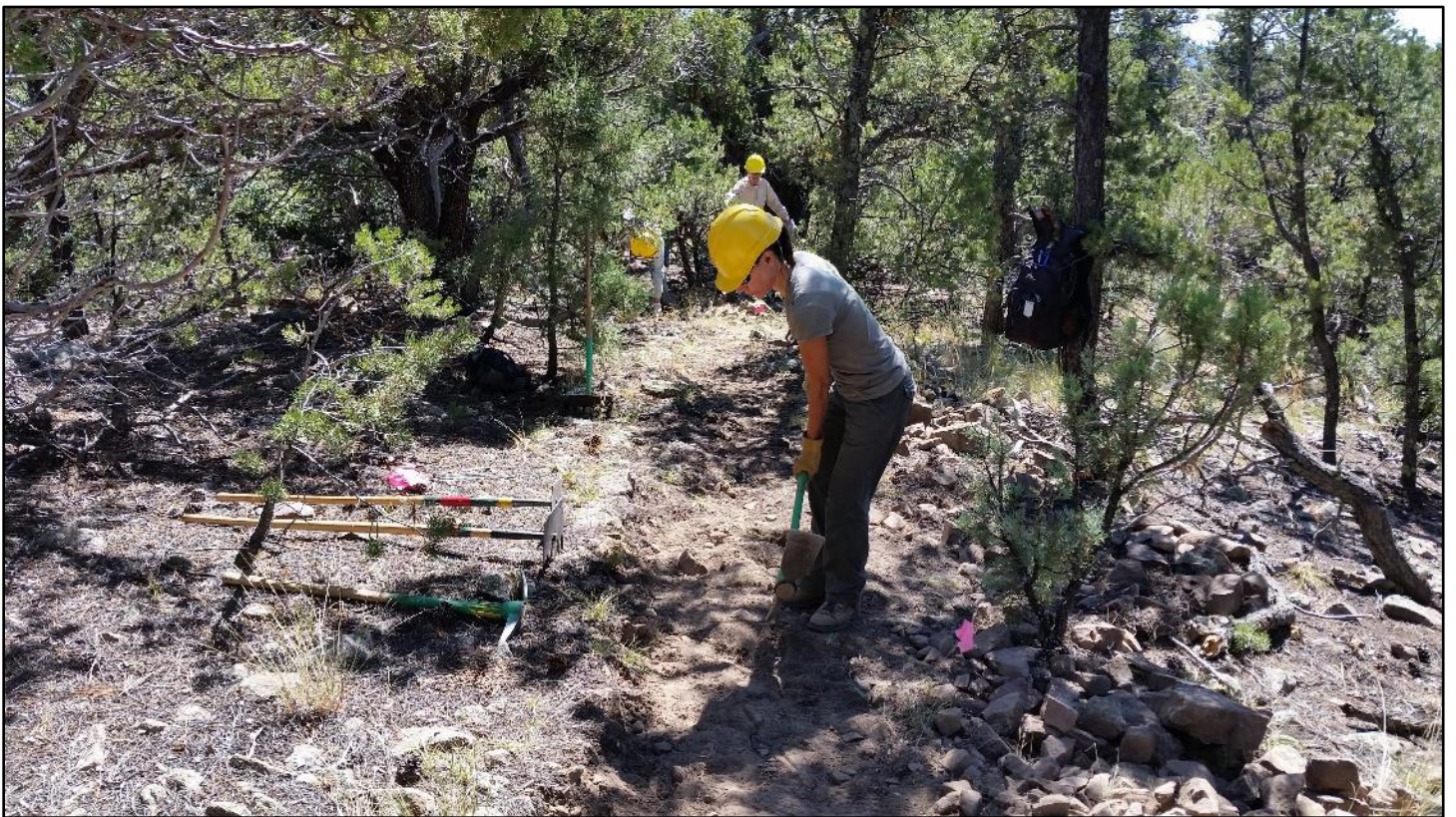
No more super steep side slope but the rocks have exponentially increased.