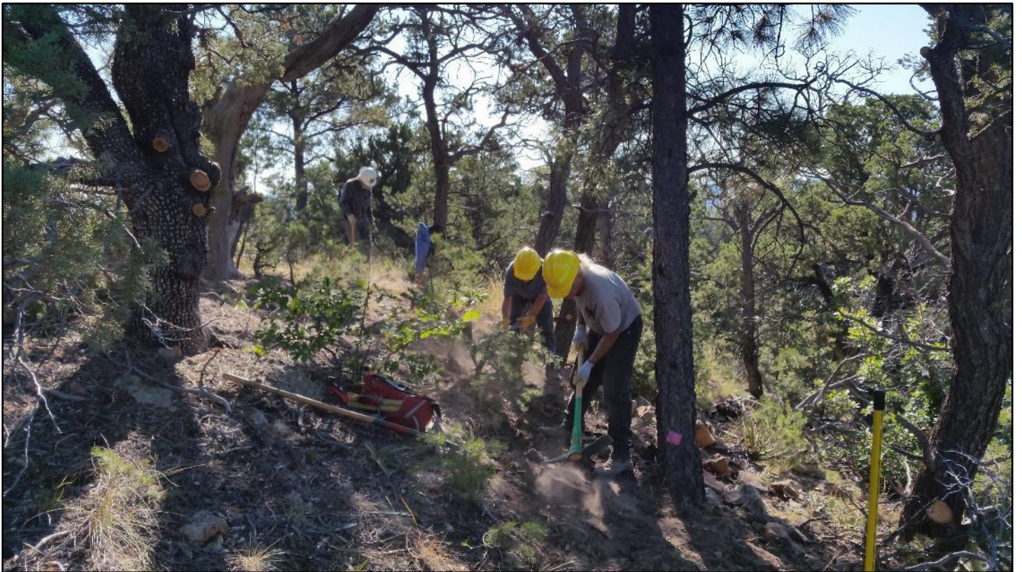
The crew is nearly to the top of the ridge. The trail corridor here was cut earlier.