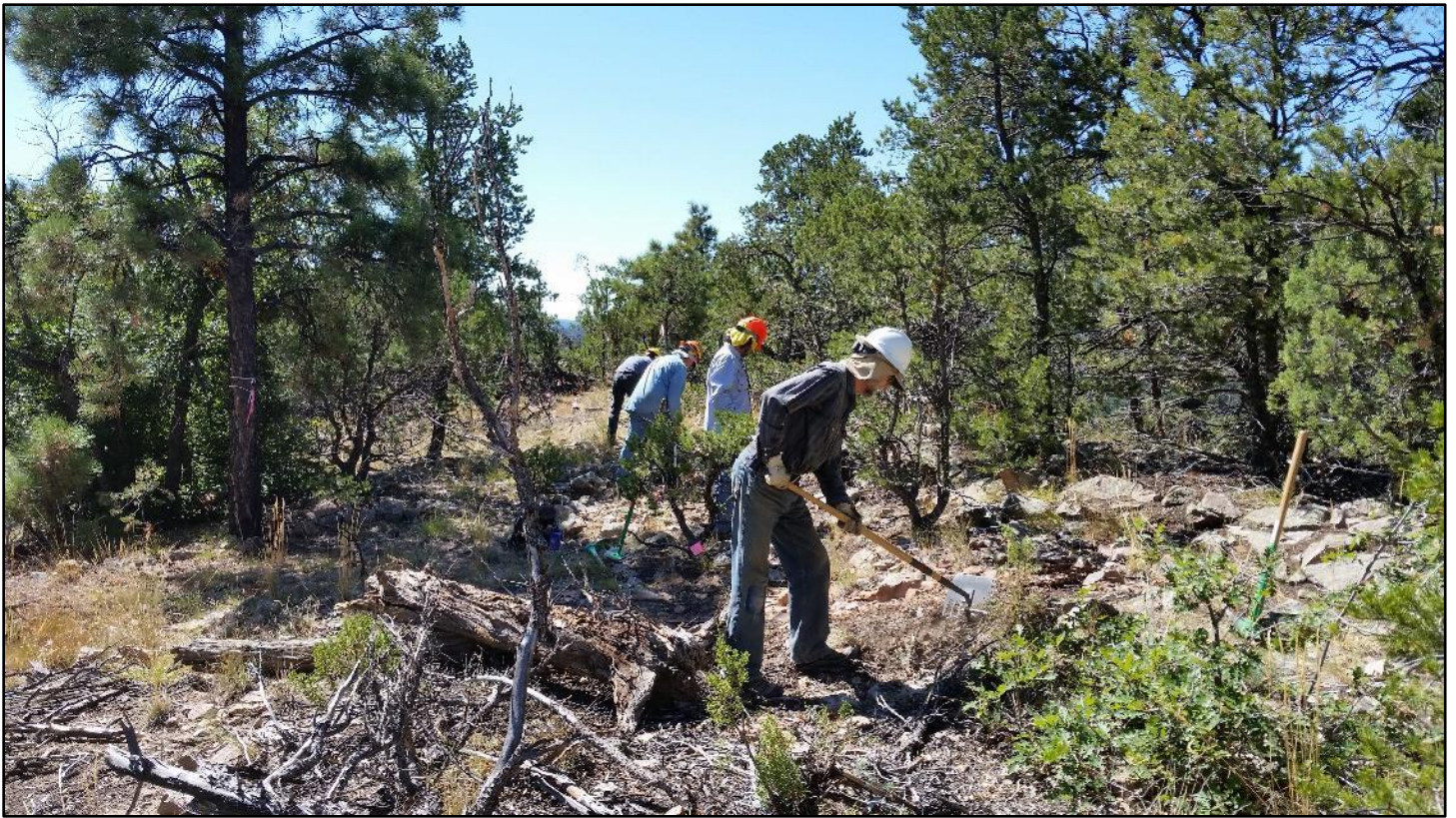
The crew has worked their way to the future connection to Deer Bed Trail.