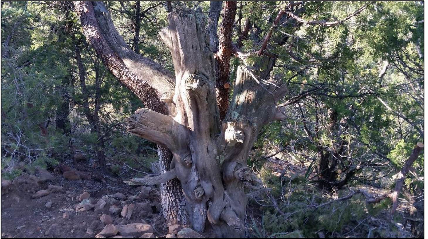
Another axe-cut alligator juniper. Evidence of people in the area long ago.