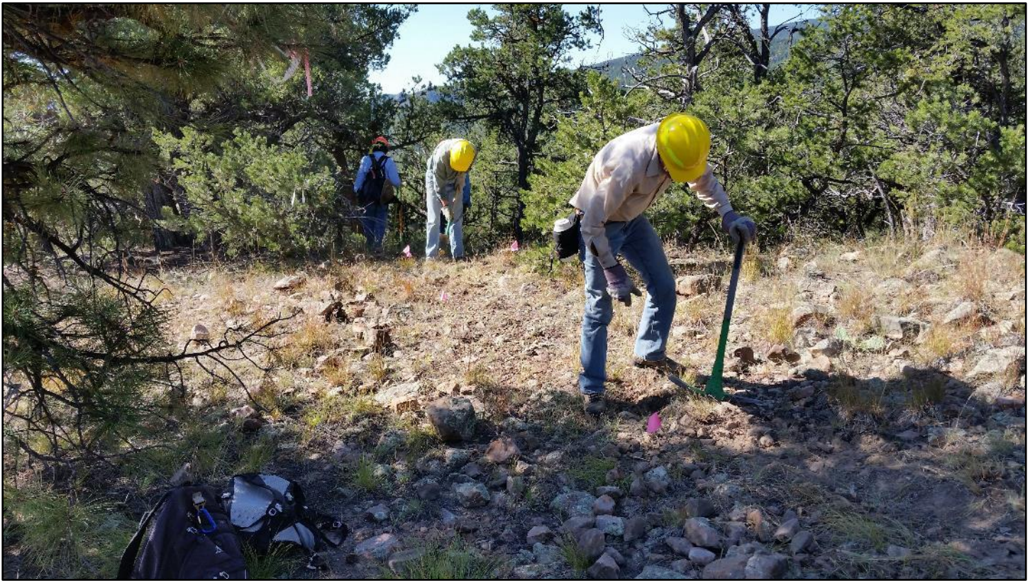
Rocks, rocks, and more rocks. Just level the tread and keep moving.