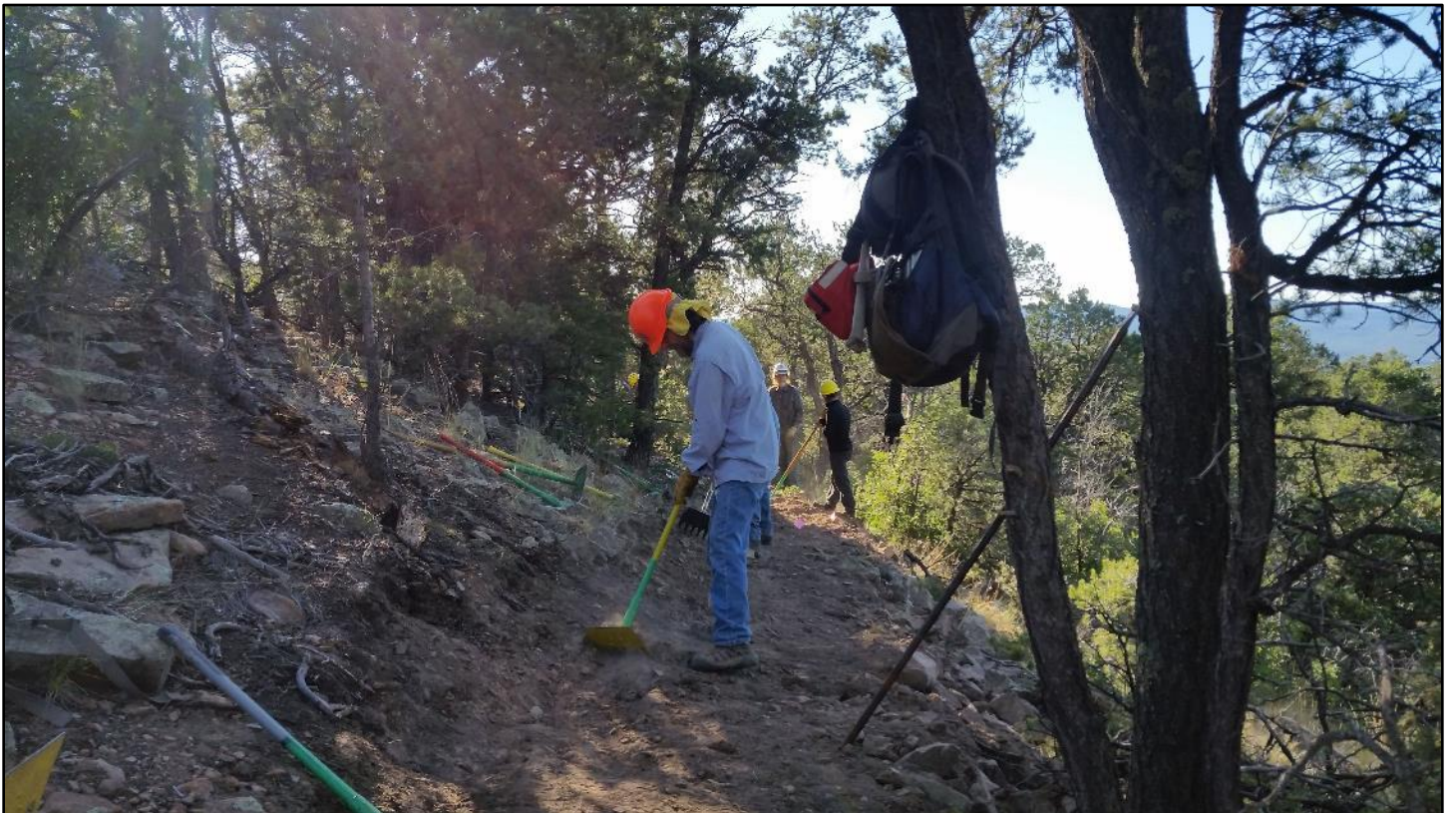
The crew has fought the steep side slope on Vista Trail long enough.