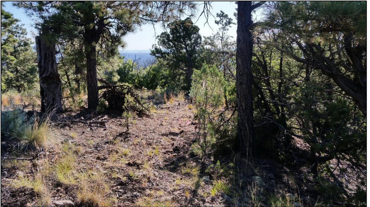
Our long-anticipated goal: the top of the ridge on Vista Trail.