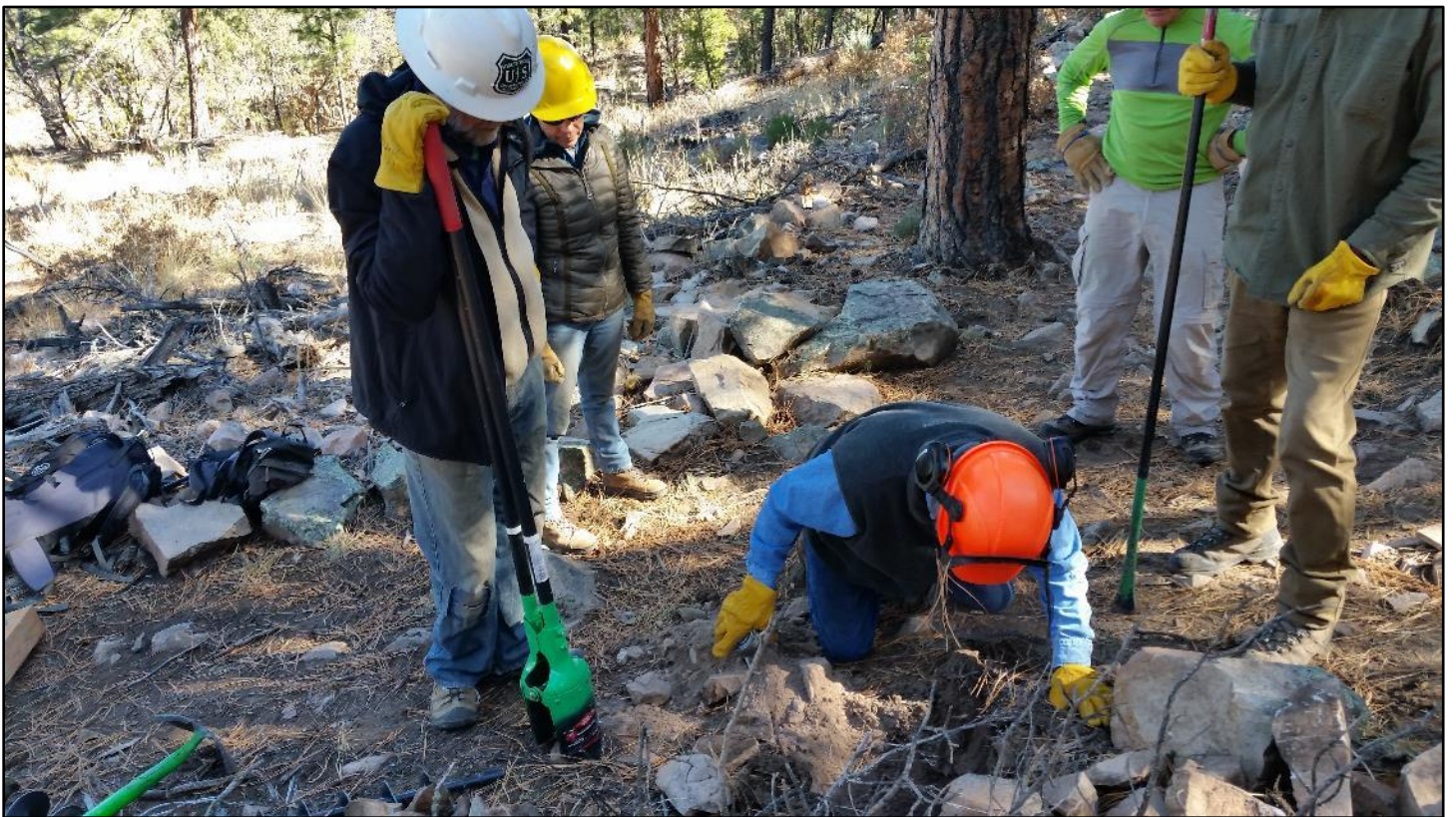
Another Chicken Can man clears the hole on what some fondly remember as the trail Turn from Hell.