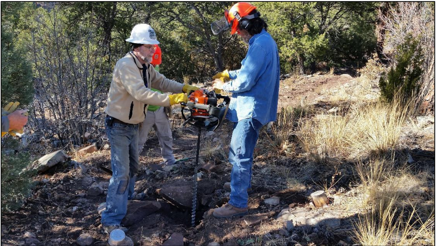
Last hole of the day for the Auger Boys. Once some BIG rocks were dug out, the auger did the rest.