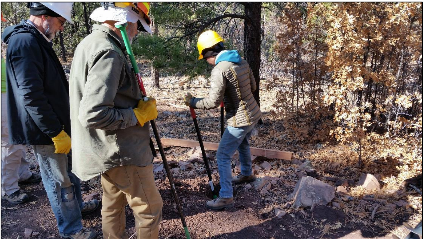
The crew rotated through the tool selection to reach required depth (and take breaks).