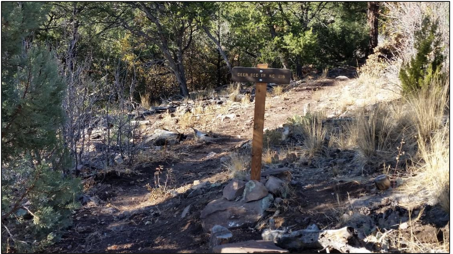
Done. The crew opted to stay out a little longer to get this eighth trail sign installed.