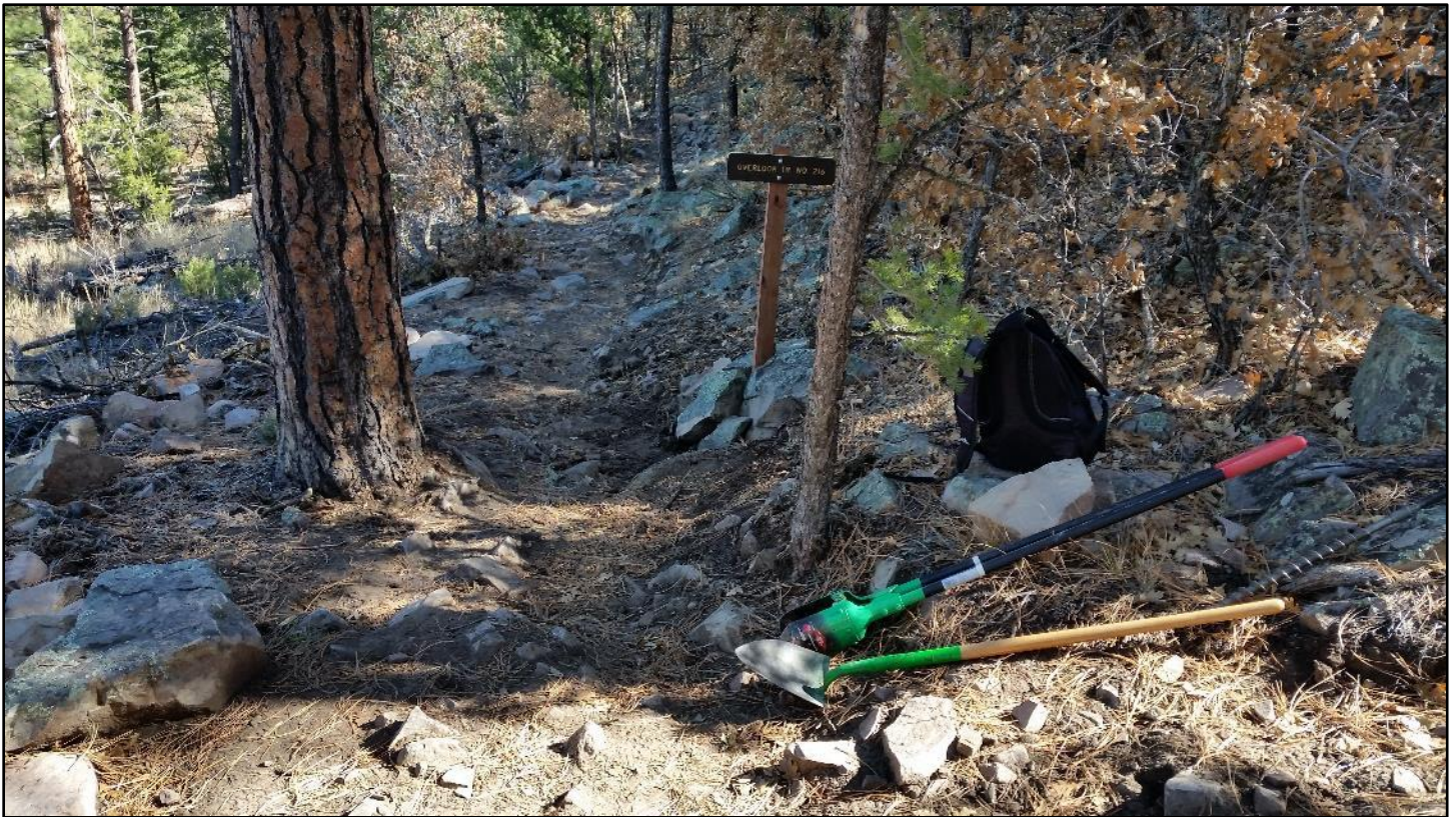
The start of Overlook Trail off of La Barba. Note the new FOSM posthole digger with depth gauge...