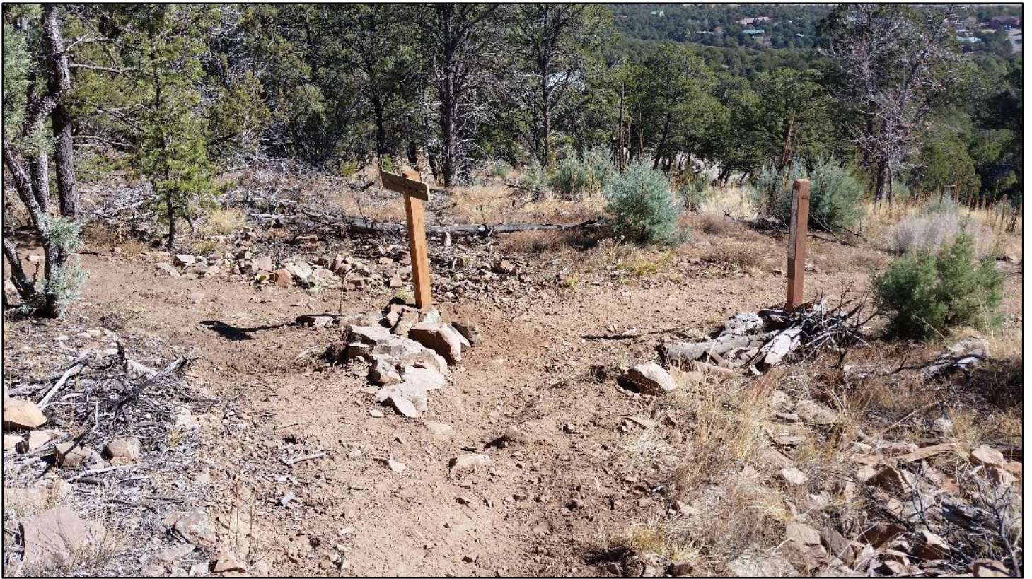
This was a tough intersection but it works. The trees on the left need to be cut to improve line of sight.