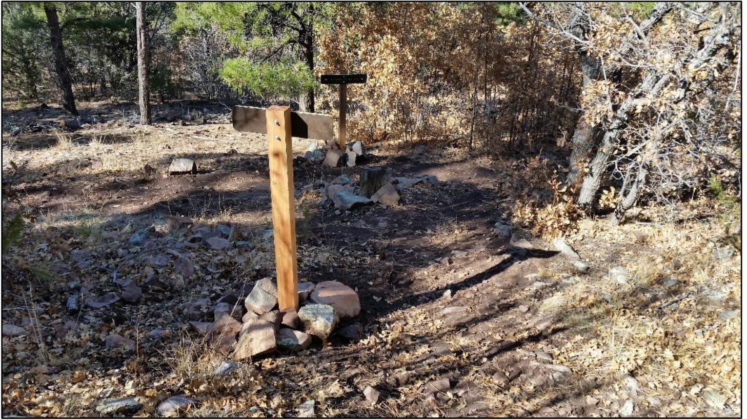
Another trail intersection finished. We found no two post holes were alike...