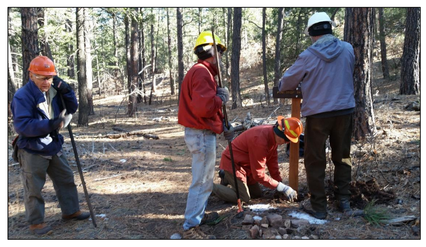
Packing in the rock fill. Many rocks were frozen to the ground and had to be pried out.