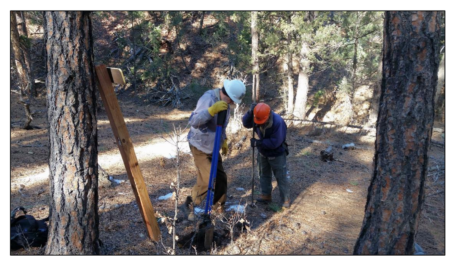
No auger was needed. The moist soil had few rocks, requiring minimal coaxing from the digging bar.