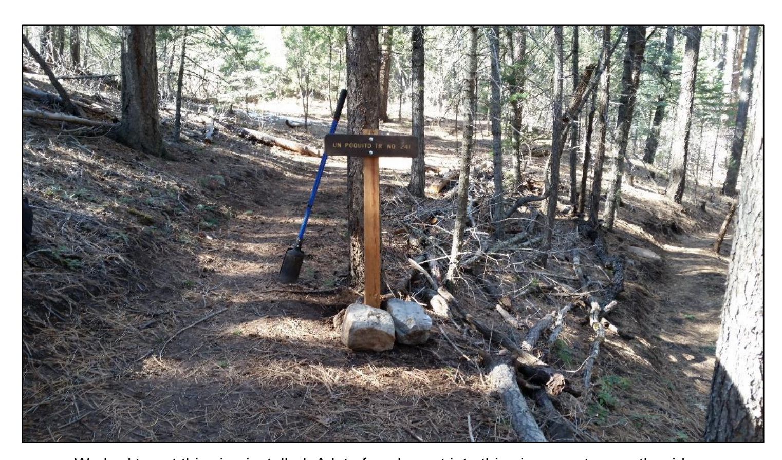
We had to get this sign installed. A lot of work went into this nice reroute over the ridge.