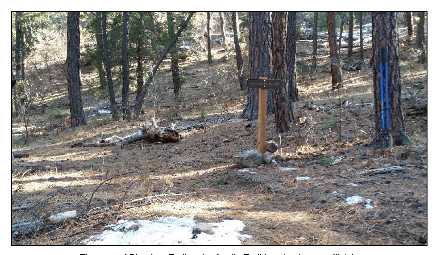
The start of Pinedrop Trail at the Armijo Trail junction is now official.