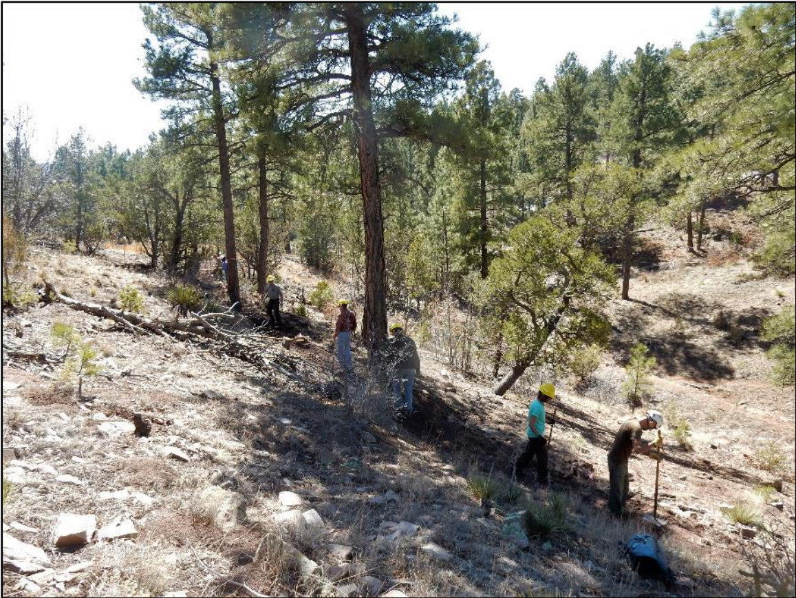
The crew then started to work their way up another reroute in steep side slope.