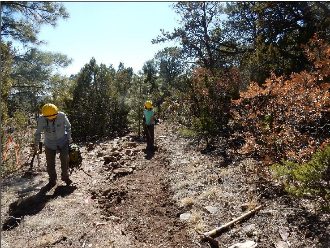
Finishing the connection to the other user trail.