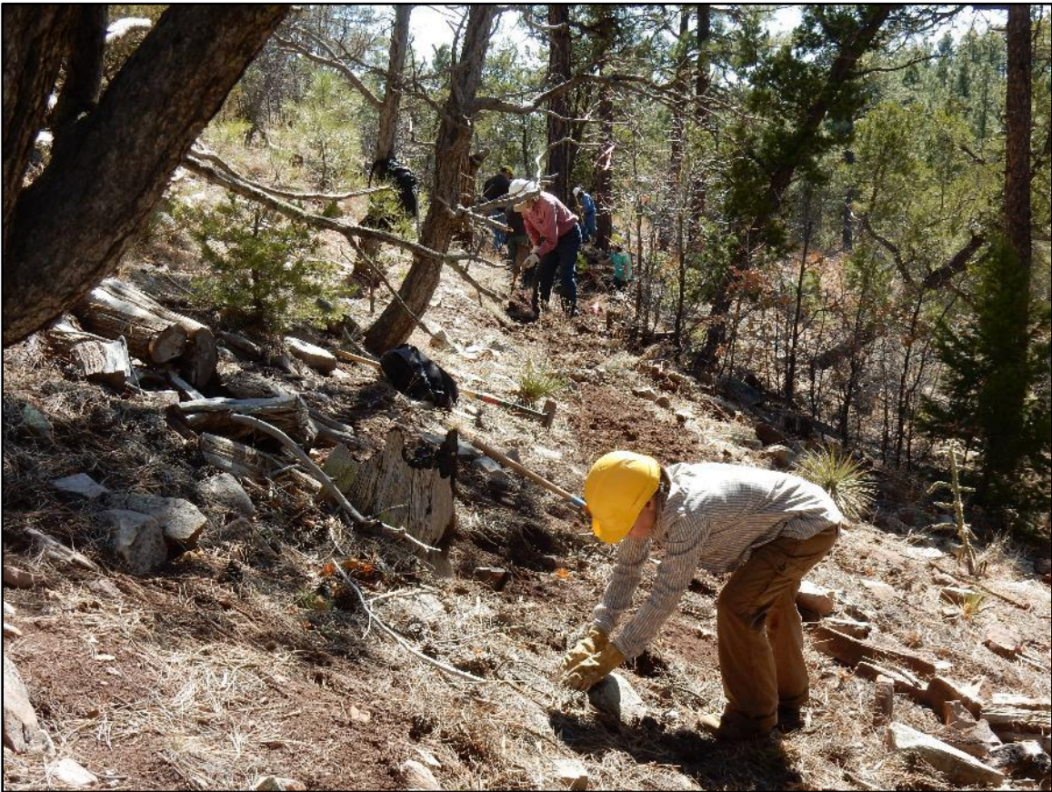
Of course there were still plenty of rocks to pull out.