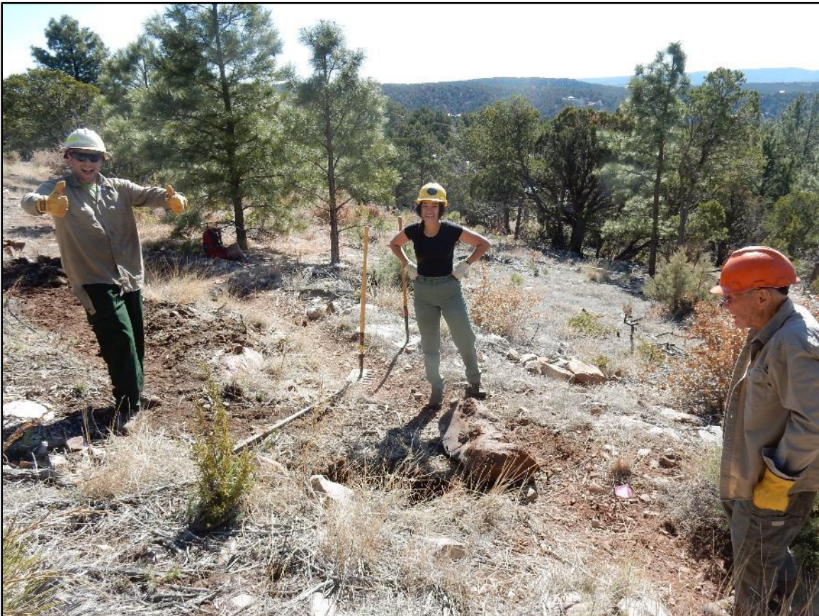
At the user trail connection: this big boulder just had to come out of the tread.