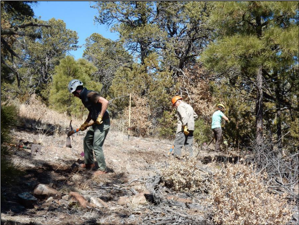
At the upper end of the section, the crew worked to connect to another user trail.