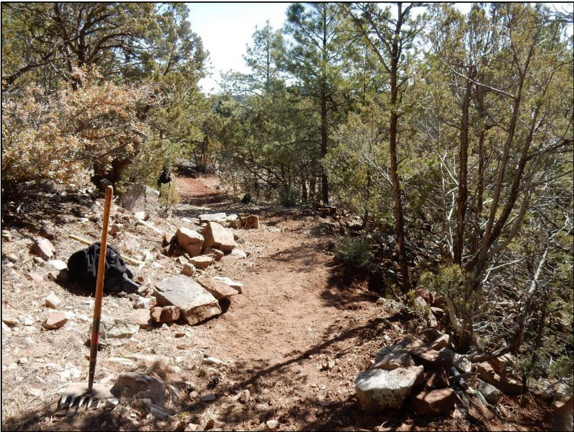
The old road bed is narrowed and the drainage is much improved.