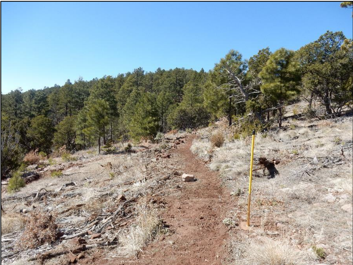
After: this crew just builds really nice trail.