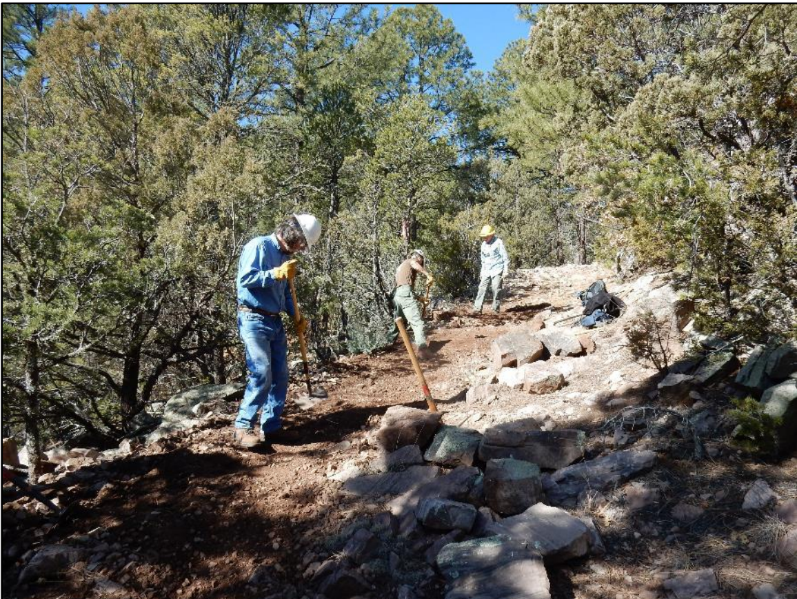
Meanwhile, another crew works to improve drainage on an old road bed.