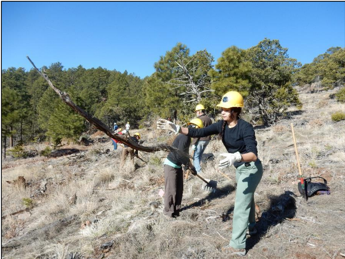
Before: the crew works their way towards a user trail connection, moving a lot of debris.