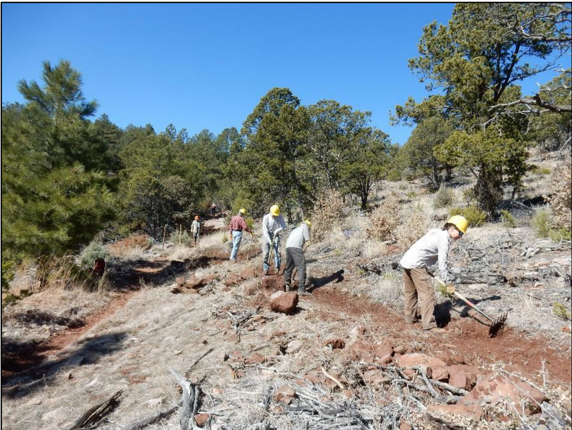
The crew has nearly reached the user trail connection.